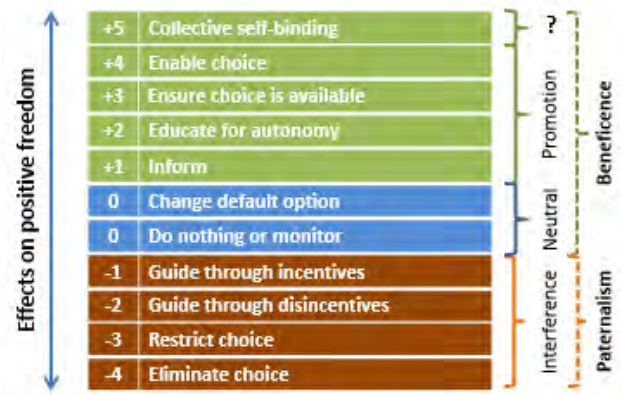
Figure 2 Assessing the effects on positive freedom using Griffiths and West's (2015) intervention ladder

Based on this positive conception of freedom, Griffiths and West suggest an alternate way of classifying the interventions targeted by the Nuffield Council on Bioethics (and add three more categories). At the bottom of their ladder, they place interventions that interfere with freedom, namely, those that encourage, discourage, restrict or eliminate options. In the middle of their ladder are options that would have no impact on freedom, namely the absence of intervention, monitoring or the replacement of one default option with another. Finally, at the top of the ladder are interventions that would promote freedom by informing, educating for autonomy, ensuring an option is available, enabling choice and those resulting from collective self-binding. We will return shortly to this last intervention category.