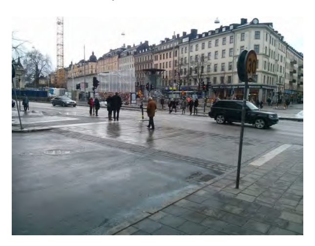
Figure 1 A sidewalk crossing in Stockholm (Sweden)

In any case, aging and its associated issues probably serve to strengthen the justification for and the importance of a number of interventions, standards or principles already promoted by many public health actors. Indeed, densification, increased mixity of land use and the connectivity of public roadway networks, as well as designs that encourage active modes of transportation and enhance their safety (protected bike paths, raised intersections and other protective devices separating active modes of travel from the flow of motorized traffic or slowing down motor vehicles) support the adoption of active modes of travel and improve transportation safety. Such devices are particularly relevant for seniors, as for other categories of persons with reduced agility and ability levels or high levels of insecurity.